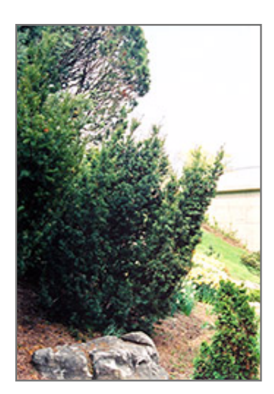
Captain Upright Yew