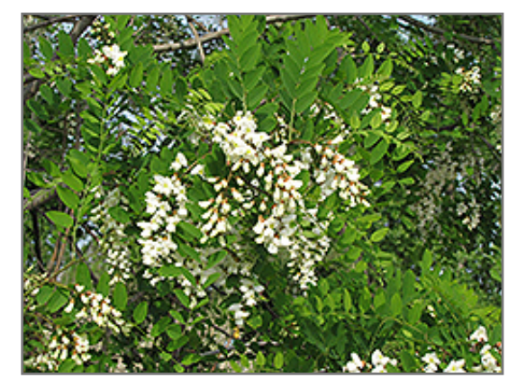
Black Locust flowers