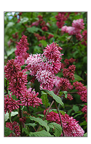
Nocturne Lilac flowers

One of the most attractive lilacs yet quite rare, produces rich pink flowers which open from wine red buds, the contrast in each flower head is shocking; a superb specimen plant, plant in full sun and well-drained soil; non-suckering