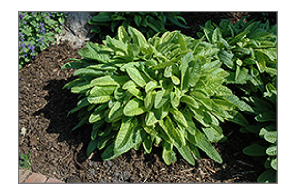
Hummelo Betony