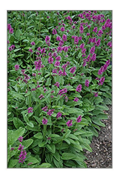
Hummelo Betony in bloom