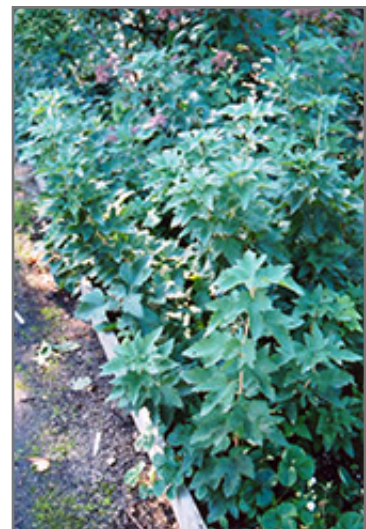
Ben Nevis Black Currant