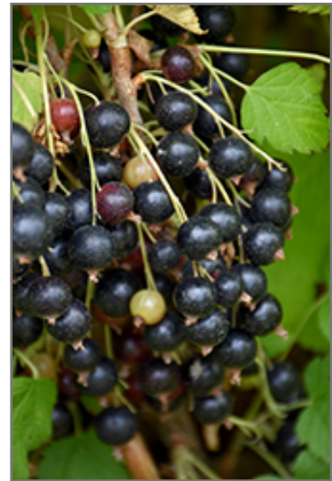
Ben Nevis Black Currant fruit

Ben Nevis Black Currant has rich green deciduous foliage on a plant with a round habit of growth. The lobed leaves turn yellow in fall. It features an abundance of magnificent black berries from mid to late summer.