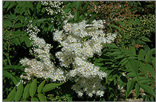
Aurora False Spirea flowers