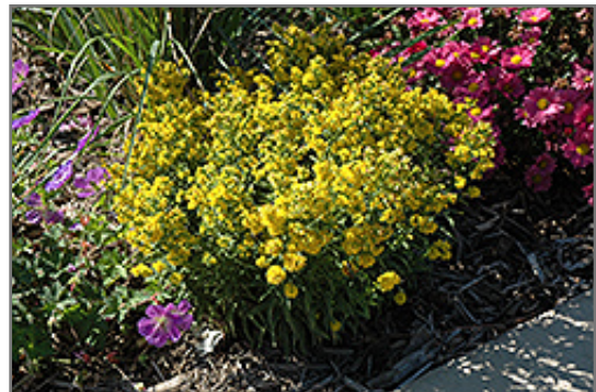
Goldrush Goldenrod in bloom