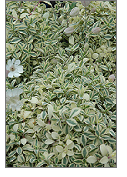
Druett's Variegated Campion in Photo courtesy of NetPS Plant Finder