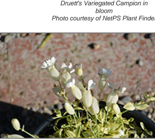
Druett's Variegated Campion flowers