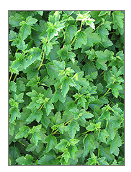
Alpine Currant foliage

This shrub performs well in both full sun and full shade. It is very adaptable to both dry and moist locations, and should do just fine under average home landscape conditions. It is considered to be drought-tolerant, and thus makes an ideal choice for xeriscaping or the moisture-conserving landscape. It is not particular as to soil type or pH. It is highly tolerant of urban pollution and will even thrive in inner city environments. This species is not originally from North America.