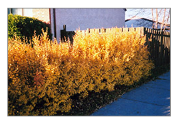
Alpine Currant in fall