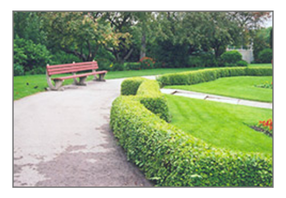
Alpine Currant

Alpine Currant is recommended for the following landscape applications;