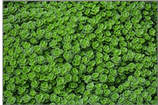
John Creech Stonecrop foliage

John Creech Stonecrop will grow to be only 3 inches tall at maturity, with a spread of 12 inches. When grown in masses or used as a bedding plant, individual plants should be spaced approximately 10 inches apart. Its foliage tends to remain low and dense right to the ground. It grows at a fast rate, and under ideal conditions can be expected to live for approximately 10 years. As an herbaceous perennial, this plant will usually die back to the crown each winter, and will regrow from the base each spring. Be careful not to disturb the crown in late winter when it may not be readily seen!