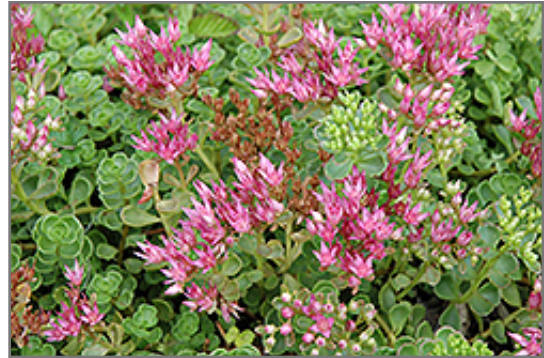
John Creech Stonecrop flowers

John Creech Stonecrop is recommended for the following landscape applications;