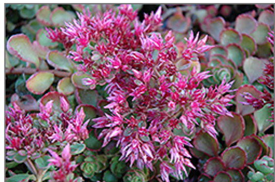
Fulda Glow Stonecrop flowers