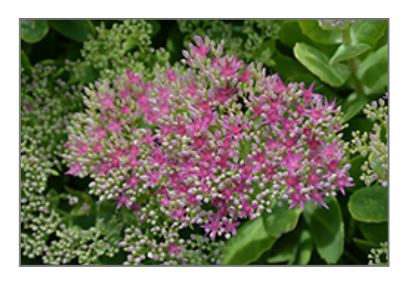
Neon Stonecrop flower buds