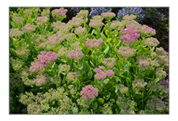
Neon Stonecrop in bloom