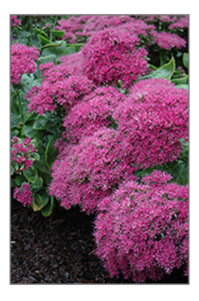
Neon Stonecrop flowers

Neon Stonecrop is a dense herbaceous perennial with an upright spreading habit of growth. Its relatively coarse texture can be used to stand it apart from other garden plants with finer foliage.