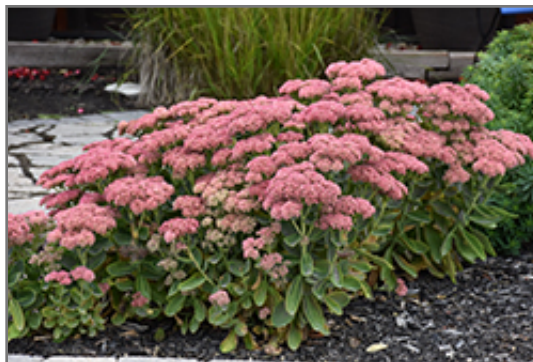
Autumn Fire Stonecrop in bloom

Autumn Fire Stonecrop is recommended for the following landscape applications;