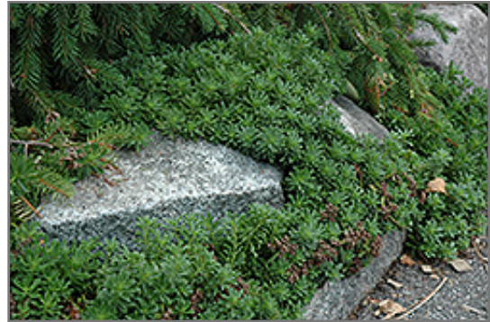
Middendorf Stonecrop foliage

Other Names: S. kamtschaticum var. middendorffianum