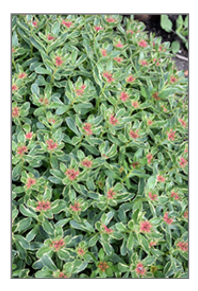
Variegated Russian Stonecrop foliage