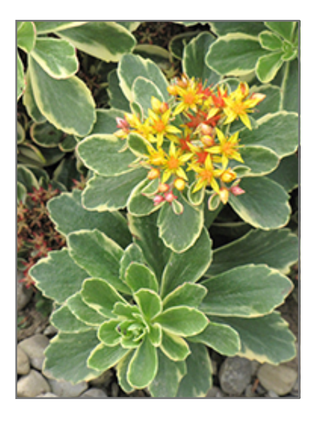
Variegated Russian Stonecrop flowers