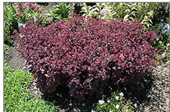
Xenox Stonecrop in bloom