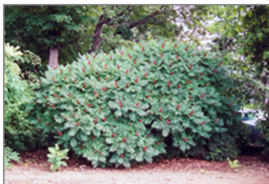
Smooth Sumac in bloom