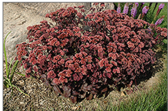
Purple Emperor Stonecrop in bloom