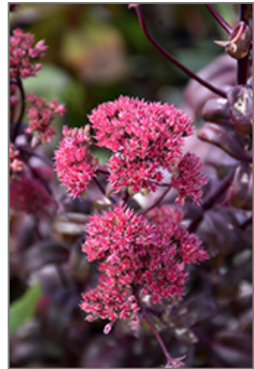
Purple Emperor Stonecrop flowers

Purple Emperor Stonecrop is a dense herbaceous perennial with an upright spreading habit of growth. Its relatively coarse texture can be used to stand it apart from other garden plants with finer foliage.