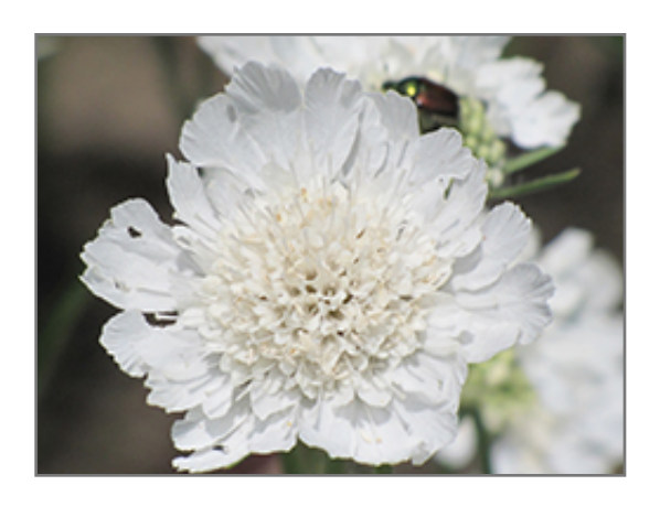
Perfecta White Pincushion Flower flowers