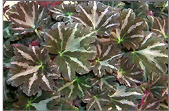
Silver Velvet Saxifrage foliage