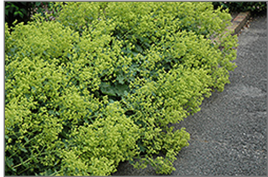
Thriller Lady's Mantle in bloom

Thriller Lady's Mantle is recommended for the following landscape applications;