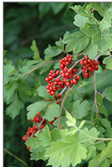
Fragrant Sumac fruit

Fragrant Sumac is recommended for the following landscape applications;