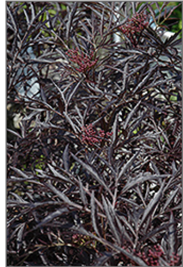
Black Lace Elder flowers

This shrub does best in full sun to partial shade. It is quite adaptable, preferring to grow in average to wet conditions, and will even tolerate some standing water. It is not particular as to soil type or pH. It is highly tolerant of urban pollution and will even thrive in inner city environments. This is a selected variety of a species not originally from North America.