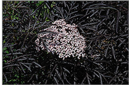
Black Lace Elder flowers

This is a high maintenance shrub that will require regular care and upkeep, and is best pruned in late winter once the threat of extreme cold has passed. It is a good choice for attracting birds to your yard. Gardeners should be aware of the following characteristic(s) that may warrant special consideration;