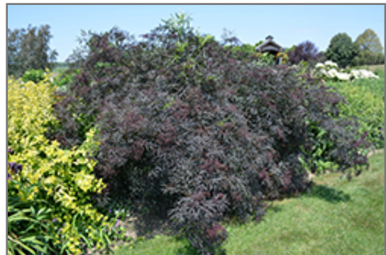
Black Lace Elder