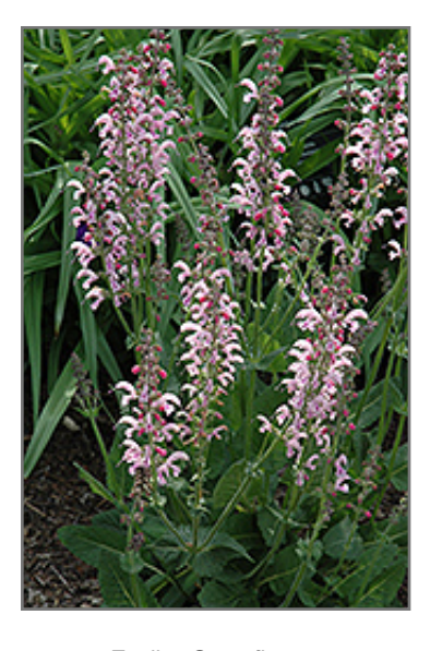
Eveline Sage flowers

Eveline Sage has masses of beautiful spikes of shell pink flowers with lavender overtones rising above the foliage from late spring to early summer, which are most effective when planted in groupings. The flowers are excellent for cutting. Its attractive fragrant narrow leaves remain grayish green in colour throughout the season.