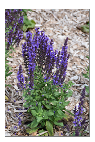
Blue Queen Sage in bloom