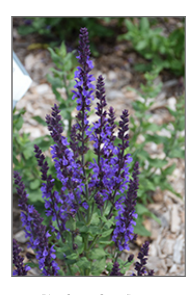
Blue Queen Sage flowers

Blue Queen Sage is recommended for the following landscape applications;