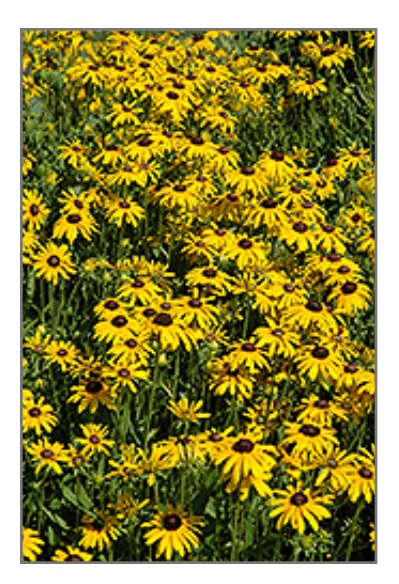
Golden Elf Coneflower flowers