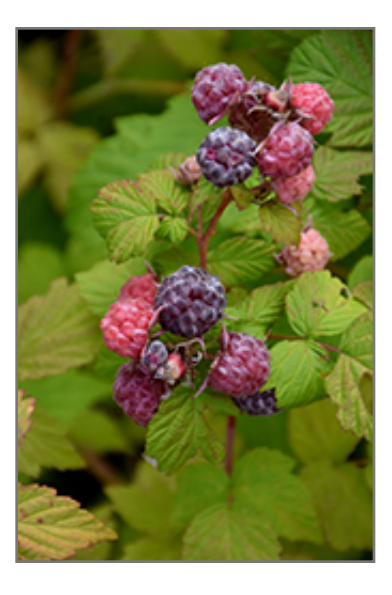
Jewel Black Raspberry fruit

A relatively disease-resistant variety of black raspberry producing firm, glossy and flavorful fruit in summer; raspberries are quite shrubby looking and require careful placement in the landscape, a specific pruning regimen and protection from birds