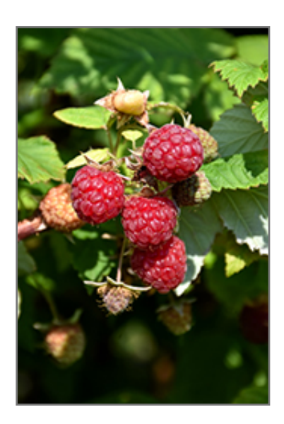
Boyne Raspberry fruit

This is an open multi-stemmed deciduous shrub with an upright spreading habit of growth. Its relatively coarse texture can be used to stand it apart from other landscape plants with finer foliage. This is a high maintenance plant that will require regular care and upkeep. Each spring, cut back all dead and two-year old canes to the ground, leaving only last year's growth standing. It is a good choice for attracting birds to your yard. Gardeners should be aware of the following characteristic(s) that may warrant special consideration;