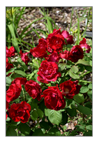
Emily Carr Rose flowers