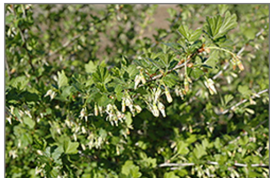
Pixwell Gooseberry flowers