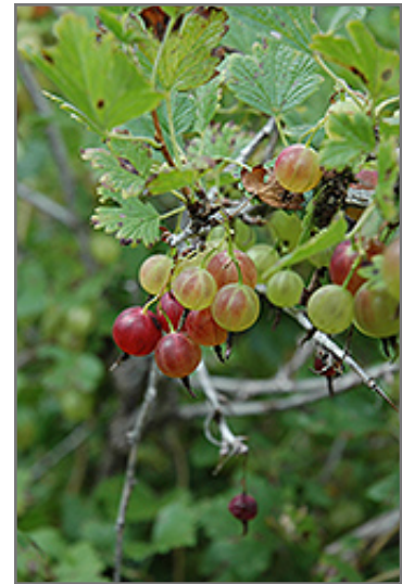
Pixwell Gooseberry fruit

Pixwell Gooseberry has rich green deciduous foliage on a plant with an upright spreading habit of growth. The lobed leaves turn yellow in fall. It features an abundance of magnificent chartreuse berries with salmon blush in early summer.