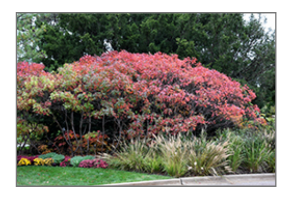
Prairie Flame Shining Sumac in fall

This shrub does best in full sun to partial shade. It is very adaptable to both dry and moist growing conditions, but will not tolerate any standing water. It is not particular as to soil type or pH. It is highly tolerant of urban pollution and will even thrive in inner city environments. This is a selection of a native North American species.