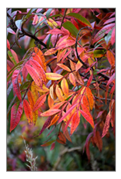
Prairie Flame Shining Sumac in fall

This is a high maintenance shrub that will require regular care and upkeep, and is best pruned in late winter once the threat of extreme cold has passed. It is a good choice for attracting butterflies to your yard. Gardeners should be aware of the following characteristic(s) that may warrant special consideration;