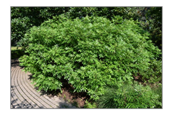
Prairie Flame Shining Sumac