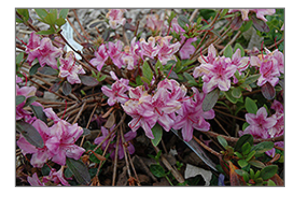
Compact Korean Azalea flowers