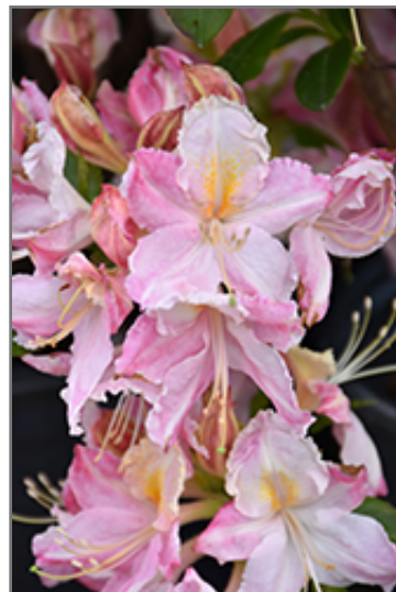
Tri-Lights Azalea flowers