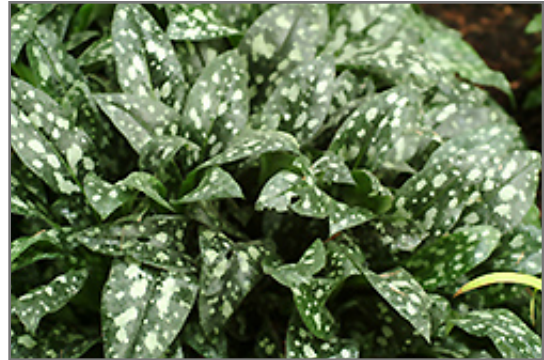
Milky Way Lungwort foliage

Other Names: Lords And Ladies, Bethlehem Sage