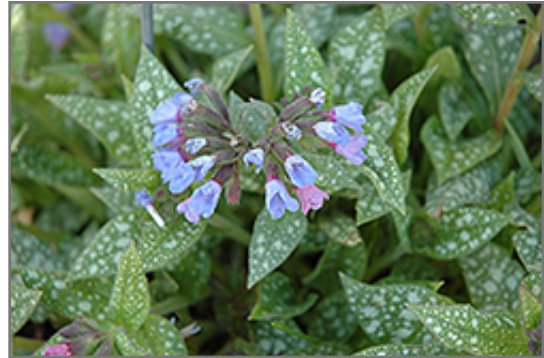
Janet Fisk Lungwort flowers

Other Names: Lords And Ladies, Bethlehem Sage