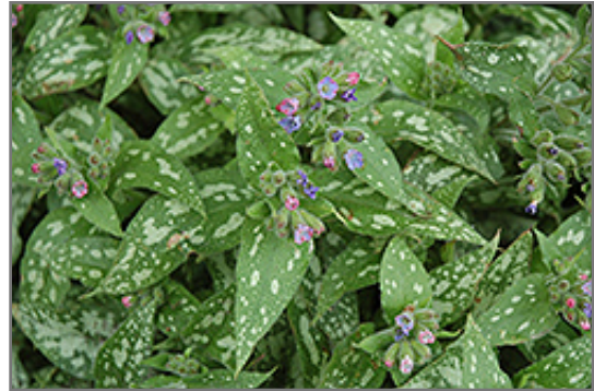
Gaelic Spring Lungwort flowers

Other Names: Lords And Ladies, Bethlehem Sage