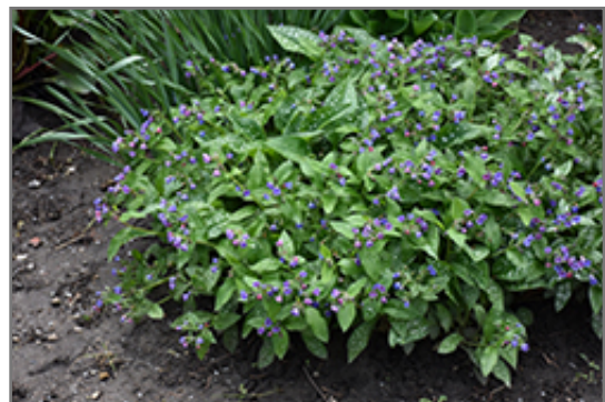
Dark Vader Lungwort in bloom