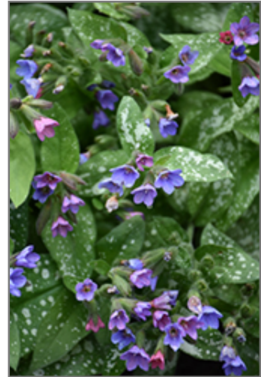
Dark Vader Lungwort flowers