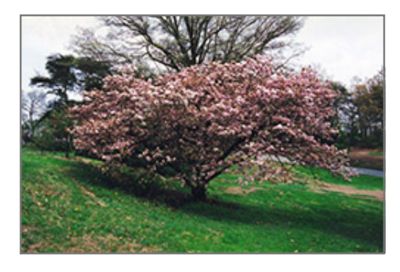
Takasago Flowering Cherry in bloom