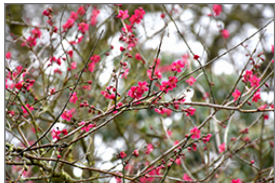
Japanese Apricot flowers