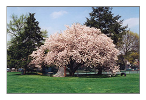
Hizakura Flowering Cherry in bloom