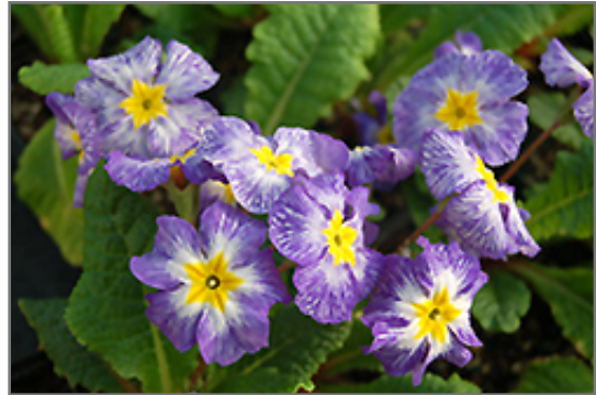
Tie Dye Primrose flowers