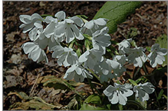
Snowflakes Primrose flowers

Snowflakes Primrose will grow to be only 4 inches tall at maturity extending to 8 inches tall with the flowers, with a spread of 9 inches. When grown in masses or used as a bedding plant, individual plants should be spaced approximately 7 inches apart. Its foliage tends to remain low and dense right to the ground. It grows at a fast rate, and under ideal conditions can be expected to live for approximately 5 years. As an evergreen perennial, this plant will typically keep its form and foliage year-round.