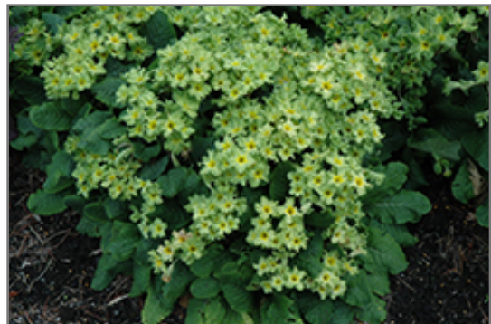
Green Lace Primrose in bloom