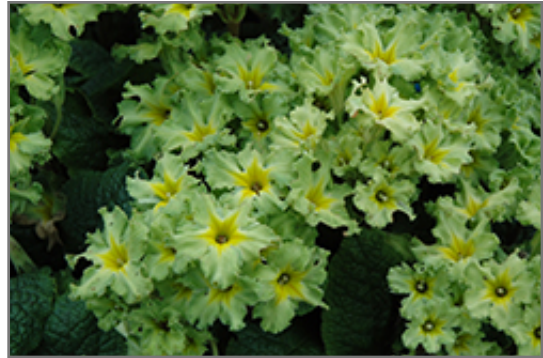
Green Lace Primrose flowers