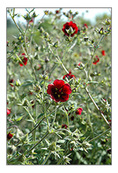
Monarch's Velvet Cinquefoil flowers