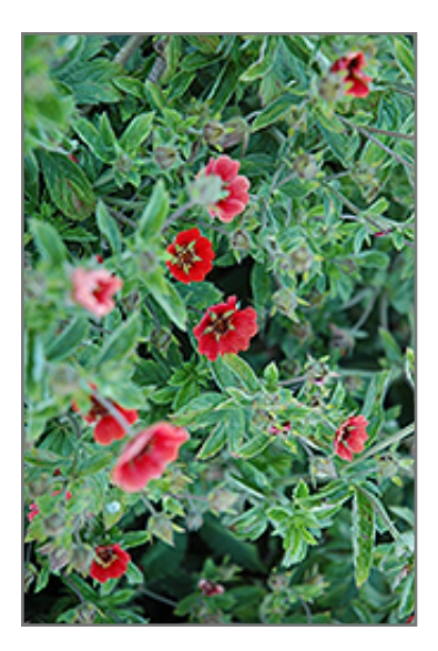
Ron McBeath Cinquefoil flowers