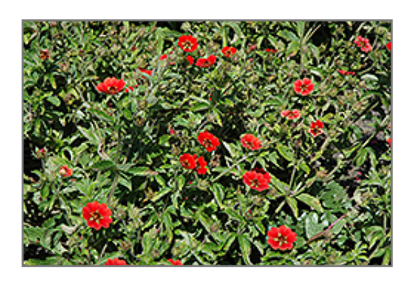
Gibson's Scarlet Cinquefoil flowers