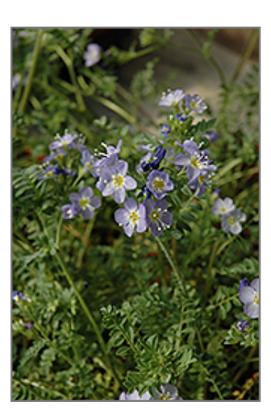
Iceberg Point Jacob's Ladder flowers

Iceberg Point Jacob's Ladder has masses of beautiful spikes of lightly-scented powder blue star-shaped flowers with yellow eyes rising above the foliage from mid spring to mid summer, which are most effective when planted in groupings. The flowers are excellent for cutting. Its ferny pinnately compound leaves remain grayish green in colour throughout the season.