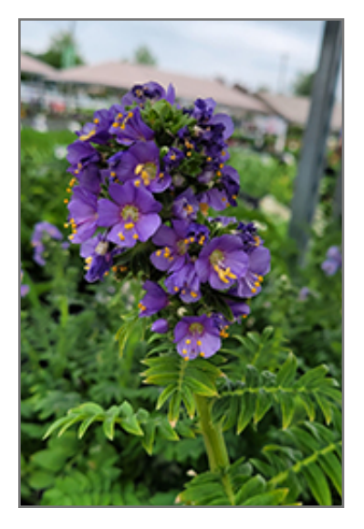
Heavenly Habit Jacob's Ladder flowers

Heavenly Habit Jacob's Ladder has masses of beautiful spikes of lightly-scented lilac purple star-shaped flowers with white eyes and yellow anthers rising above the foliage from mid spring to mid summer, which are most effective when planted in groupings. The flowers are excellent for cutting. Its ferny pinnately compound leaves remain dark green in colour throughout the season.