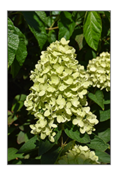
Dragon baby Hydrangea flowers

Dragon baby Hydrangea will grow to be about 3 feet tall at maturity, with a spread of 3 feet. It tends to be a little leggy, with a typical clearance of 1 foot from the ground. It grows at a medium rate, and under ideal conditions can be expected to live for 40 years or more.