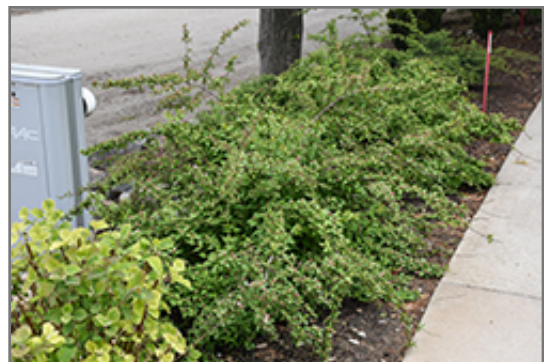
Jolene Jolene Beautybush