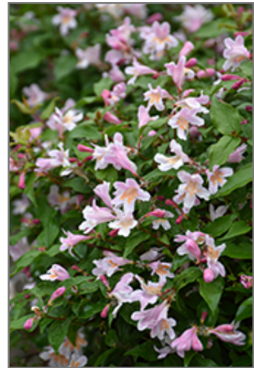
Jolene Jolene Beautybush flowers

Jolene Jolene Beautybush is recommended for the following landscape applications;